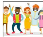
Your class teachers